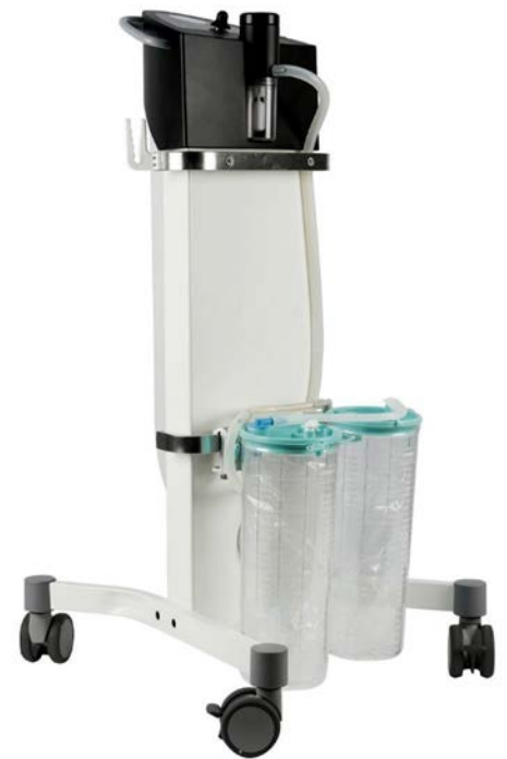
Vacusat Power Referencia: 00002252