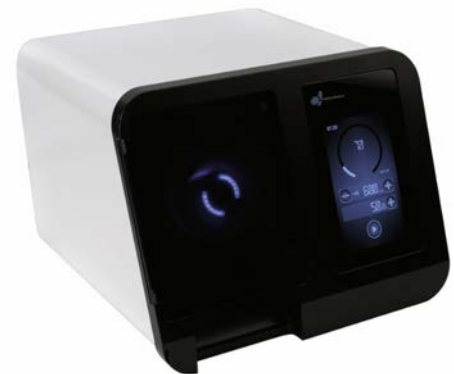
CE0482 Clase IIb